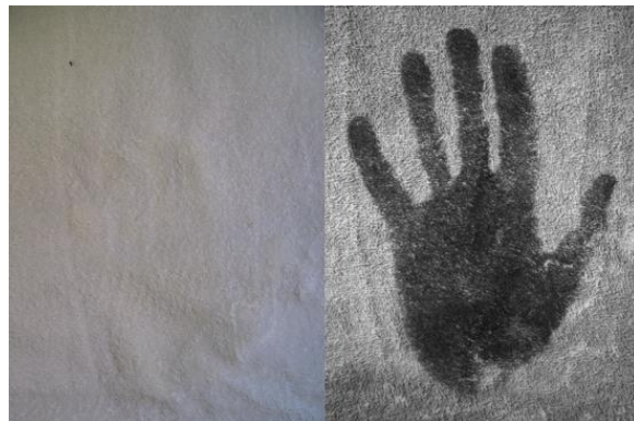
Visible and UV image pairs, clockwise from top left: New and old paint contrast in UV, shoe impression in floor wax, hand lotion handprint on towel, white car with repainted door